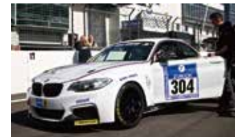
BMW M235i Racing

Every year, more than 200,000 spectators come to the 24 hour race. This scale can't be experienced in Japan, other than this race and you must be fascinated by everything. The door to the world is open to you.